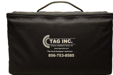
(1) 600FKCC Carrying Case

Each test cord is labeled with the part number & has red color bands at each end (See Fig. 1 above).