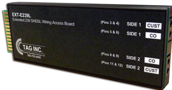
(1) FTR UPN # EXT-E239L Extended 239 SHDSL Wiring Access Board w/ Bantam Jacks