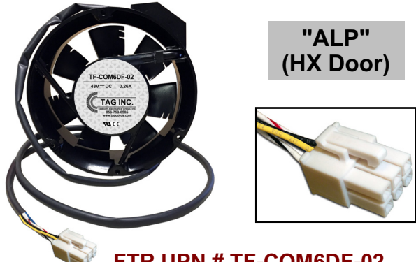
"ALP" (HX Door)

PN # TF-COM6DF-04 (call for pricing) 48V Fan for CommScope Cabinet, 6D/F Bay, HECI VAUCADY(XXX) w/ Internal Thermal Sensor & w/ 3 Wire, 4 Pin Connector (4' cable) (Commonly used w/ existing 4 pin adapter cable in fan tray)