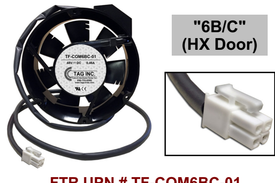
"6B/C" (HX Door)

FTR UPN # TF-COM6DF-02 48V Fan for CommScope Cabinet, ALP HX Door w/ 5 Wire, 6 Pin Connector (4' cable) (Commonly used w/ existing 100k thermistor extension cable)