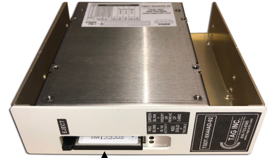
NEW TAPE DRIVE COMPACT FLASH TSD-CF-04 Industrial Grade Compact Flash 4GB Telecom Assistance Group, Inc. 856-753-8585 www.tagcords.com