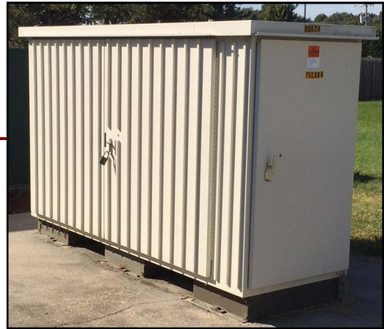
LS2000 CABINET (OUTSIDE VIEW)