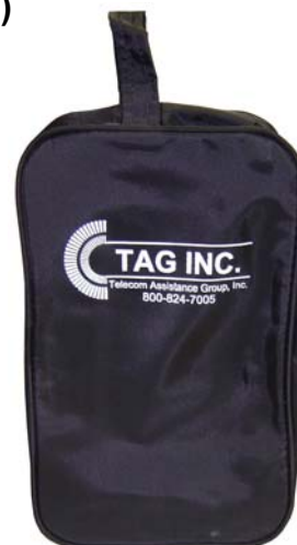
600209S Carrying Case

The H2VM Voltage Monitor is used to verify power on HDSL 2 Wire and 4 Wire Circuits at the MDF and other Cross Connect points.