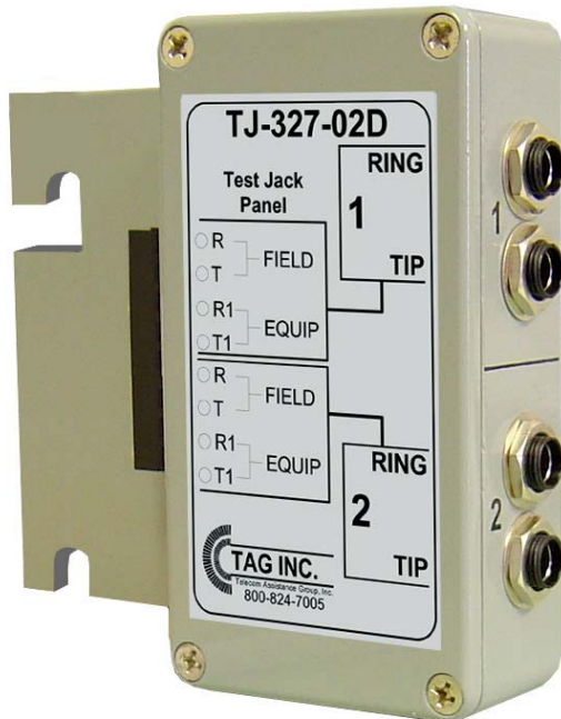
TJ-327-02D Test Jack Panel w/2 327C Jacks