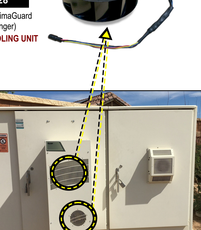
NEXT LEVEL CABINET (OUTSIDE VIEW)