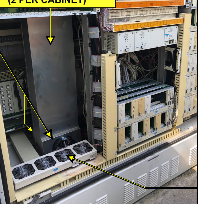
MESA 6 - MARCONI CABINET (INSIDE VIEW)