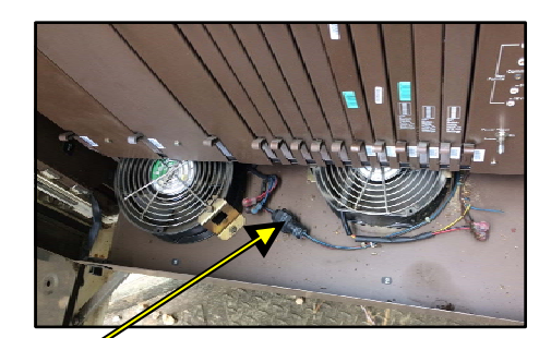
TRAY VIEW FANS w/ WEATHERPROOF PLUG (2) FANS PER TRAY