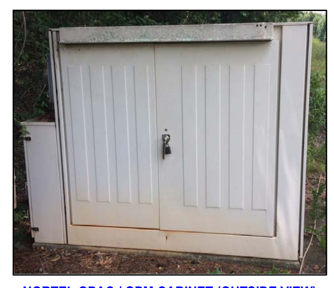
NORTEL OPAC / OPM CABINET (OUTSIDE VIEW)