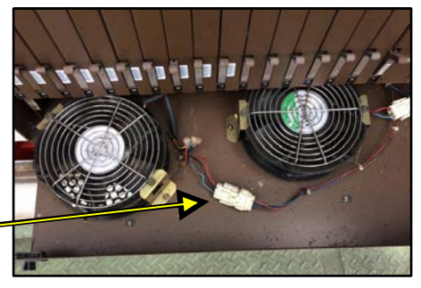
TRAY VIEW -FANS w/ SEALED 3 PIN PLUG (2) FANS PER TRAY

150 Cooper Rd. (F-15) W. Berlin, NJ 08091