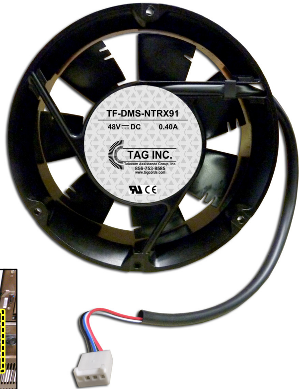
3 Wire Plug

(use in DMS-100 NTRX91AA / NT0X91AA fan units (MVIE and CSDM bays), CLEI: ENMYACM)