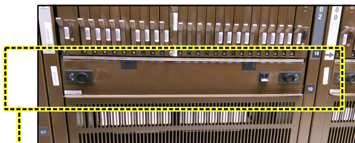
DMS-100 NTRX91AA FAN UNIT w/ EXISTING FANS