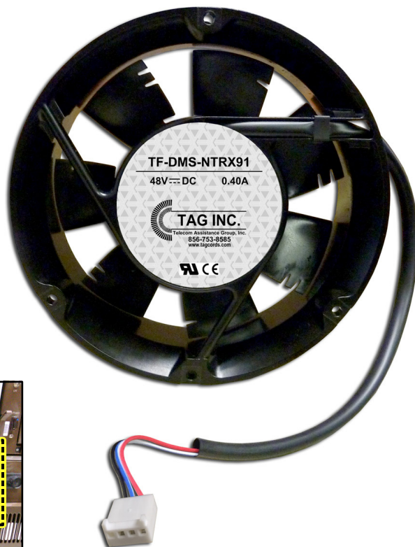
3 Wire Plug

(use in DMS-100 NTRX91AA / NT0X91AA fan units (MVIE and CSDM bays), CLEI: ENMYACM)