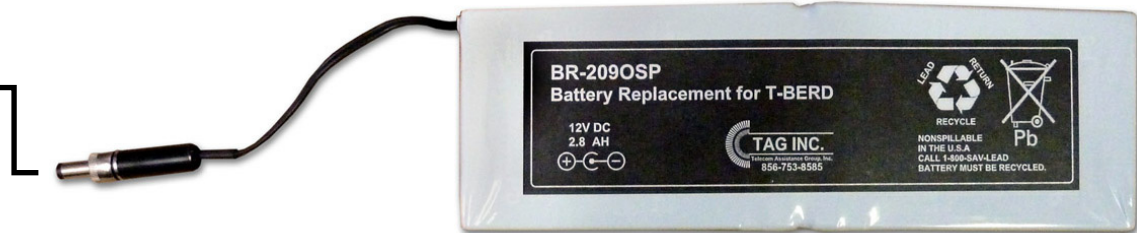
BR-209OSP Battery Replacement for T-Berd*