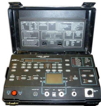
T-Berd* 209 OSP Test Set (not included)