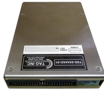
NEW HARD DRIVE