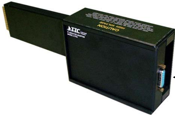
TTC T1 Repeater Adaptor (not included)