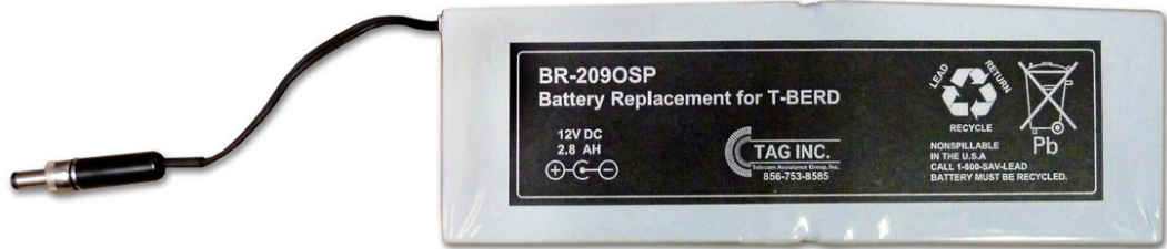
BR-209OSP Battery Replacement for T-Berd 209