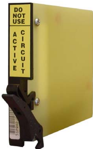
Bar coded CPR & CLEI #'S