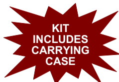
(1) PN # TCC001 8 Pouch Carrying Case (call for individual pricing)