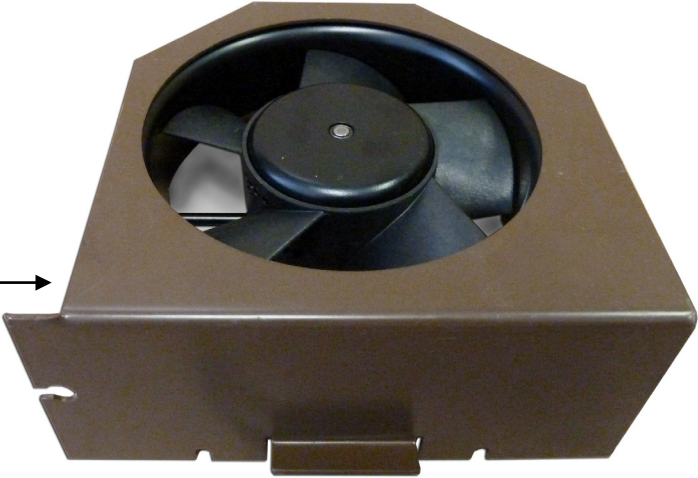
FAN SHOWN w/ EXISTING DMS-10 MOUNTING BRACKET * * (mounting bracket is not included)

TAG's PN # TF-DMS10-01 replaces defective 48 Volt DMS-10 fans.