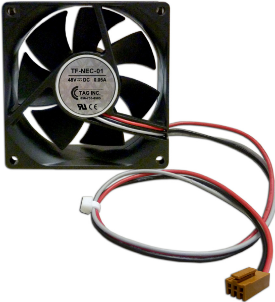
NEC FD-31201A / FD-32401A LINE TERMINATING MULTIPLEXER UNIT w/ DEFECTIVE FANS