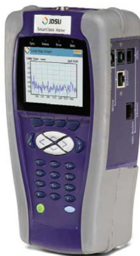
JDSU Smart Class* xDSL Test Set (not included)

The TAG PN # 400253JSA test cord is commonly used with the JDSU Smart Class* xDSL or the Spirent Tech-X-Flex** DSL test set.