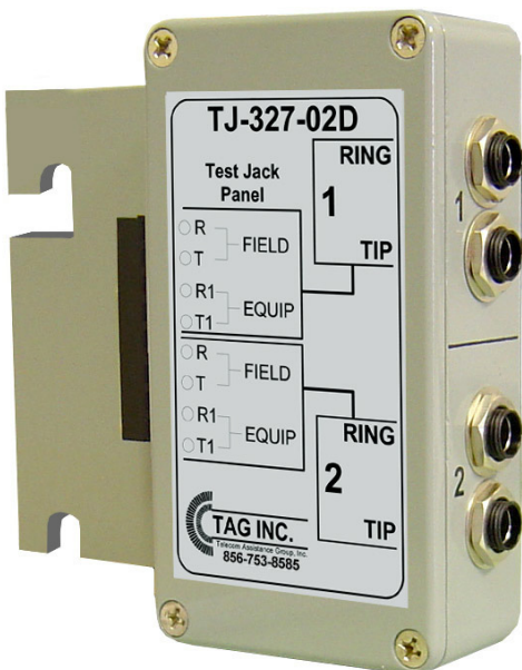
TJ-327-02D Test Jack Panel w/ (2) 327C Jacks